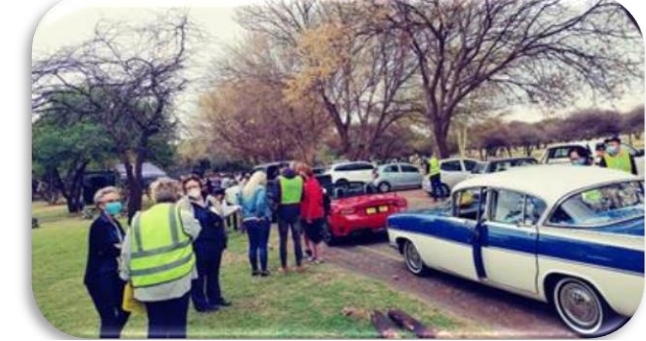
Contestants lining up at the start of the Mystery Meander