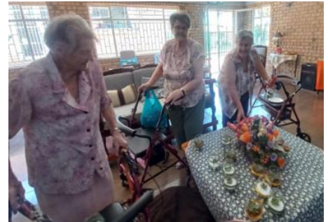
Above: The Phalaborwa Anns sprinkled the Rotary Ann Christmas magic and delivered groceries and clothing to the Majeje community