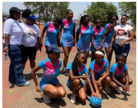
Above: The Rosebank Anns' donation enabled girls from Naledi High School to buy two sets of kit for girls who participated in the Tshepo Trust Alumni netball tournament.