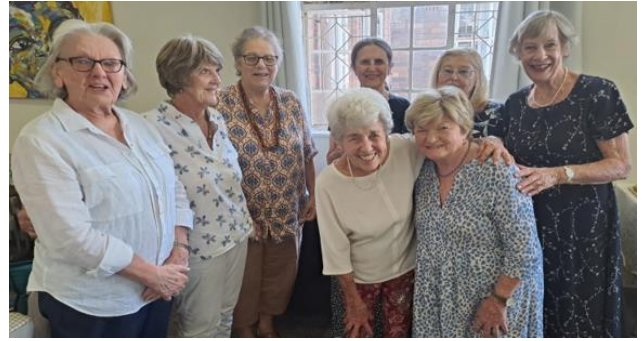
Below: White River Anns provided a tea for the residents of Rustig Retirement Village, while the Krugersdorp Anns presented the girls from Baby Moses with vouchers for Christmas, and the Pietersburg Anns worked with the Rotary clubs in the town to turn "Our Home" into Santa Land. They also presented each resident with a Christmas gift. The Christmas lights looked spectacular!