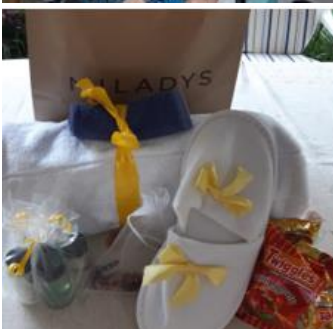
Below: Kyalami Anns made up Care parcels for the staff at Dolphins Acres and Christmas Hampers for New Life Centre for Girls. Both were much appreciated. The Anns enjoyed seeing happy faces as the gifts were delivered.