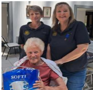
2025 arrived and the Anns hit the ground running. The Riverside Anns held their monthly book sale and donated food and adult nappies to the needy in the community