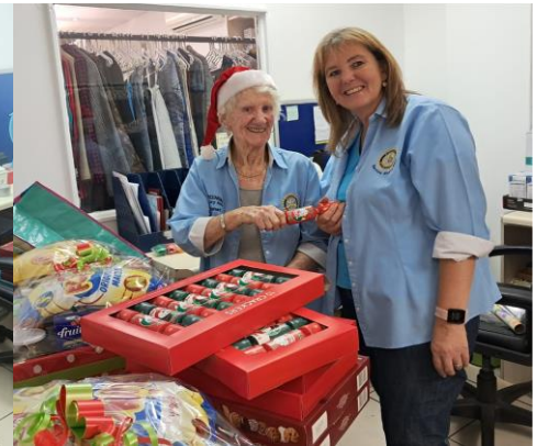
Riverside Rotary Anns looked after the children, elderly and homeless with the Christmas hampers they made. Delivering the hampers. And then they enjoyed a well-deserved rest and excellent meal.