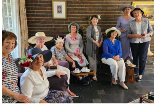
Queen Rosalind with ladies in waiting. Coronation party Kyalami Anns.