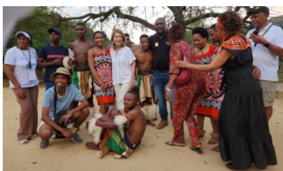
More fun at the Mantenga Cultural Village in Ezulwini and shopping at the bead studio of Project Canaan