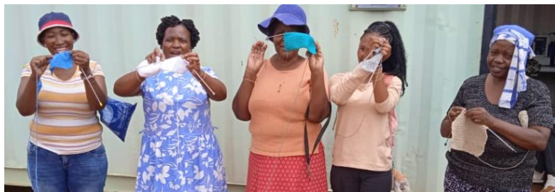
Daveyton Bespoke Sewing Project in Springs by the Rotary Anns of Benoni Aurora

The Rotary Anns of Germiston are extremely busy organising their Conference for 11 March. The registration form has been distributed and I urge each RA Club to respond early to ensure their places. It promises to be an excellent day of fun and fellowship, not to mention awards, which the DGARs and I are working on. I look forward to seeing you there.